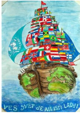
Andraž Umek (8), The whole world is on the same boat